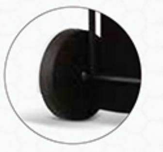
10" solid rubber