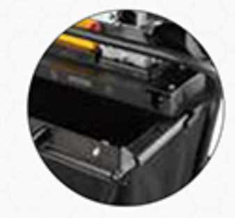
Emergency stop switch