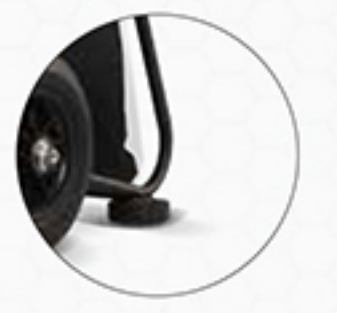
Support the machine to work stably