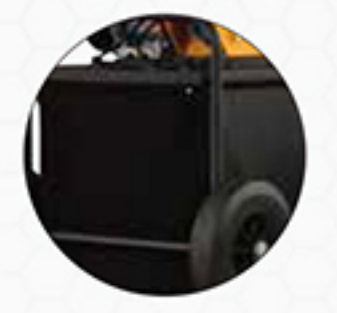
The collection bag is wear resistant, easy to replace, large capacity and so on